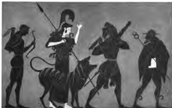
Fig. 58. Heracles carrying off Cerberus.

Here the heroes feasted or wandered together through the flowery fields, contended in games